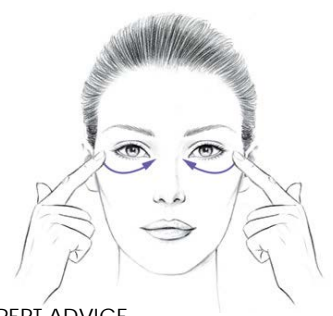
EXPERT ADVICE Smooth the eye care gently from the outer corner of the eye towards the inner corner - in the opposite direction of the wrinkles' natural formation track.