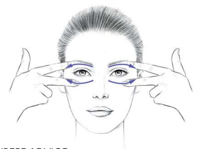
EXPERT ADVICE Apply the eye care along the lower and upper eyelid from the inner corner toward the outer corner, drain with a deep yet gentle pressure.