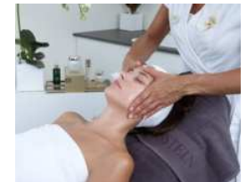
60' CABIN PROTOCOL

To help BA's to illustrate the hook by showing the loss of quality of cells after each cellular replication.