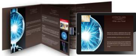
BA BROCHURE & IPAD