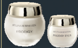
EVERY DAY & NIGHT

Like sap transfusing life at the heart of the plant, Prodigy is a "youth transfusion" all through the skin until the deepest dermis , from deep inside to renewed skin.