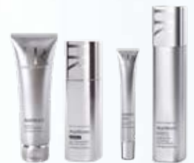
EVERY DAY & NIGHT