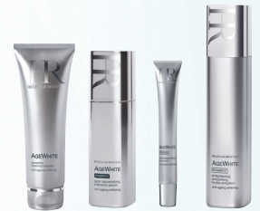
EVERY DAY & NIGHT