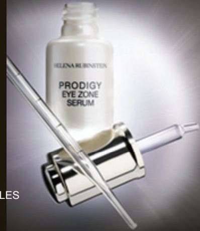
20 ml bottle