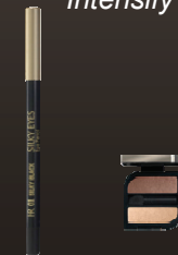
SILKY WANTED EYES